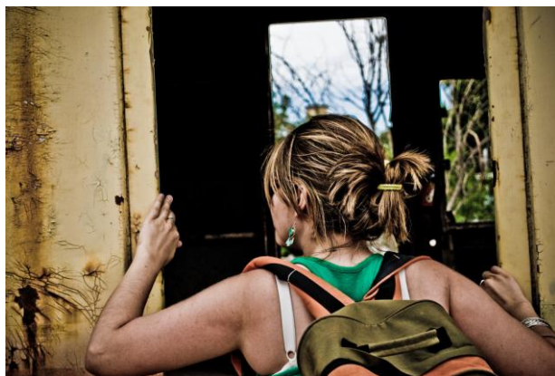
Figure 2 Flickr user Agustin Ruiz

What questions do you have before we start?