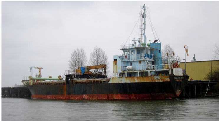
Figure 3 Flickr user Michael Chu

All our lives are touched by refugees and issues of welcome or exclusion in Canada.