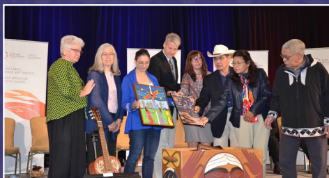
Representatives of the CRCNA join the closing ceremony of the Truth and Reconciliation Commission in Ottawa in 2015.