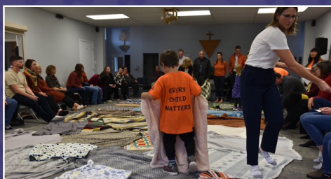
Terrace Christian Reformed Church in British Columbia marked National Truth and Reconciliation Day with a KAIROS Blanket Exercise.