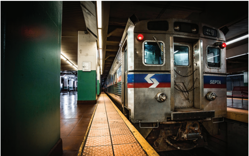
SEPTA Train.

Did you know that Black and Latino Americans often live in areas that have higher pollution than other areas? In part this is because fossil-fuel companies often seek out the most inexpensive land in proximity to communities with little or no political influence in order to avoid pushback. While individual action is important, advocacy for systemic change is also needed. In this episode we see how residents of a low-income neighborhood band together to fight for their right to breathe clean air. That fight—the joining of hands across differences in generation, race, religion, and class—has led to small yet poignant victories in Hunting Park and nearby communities.