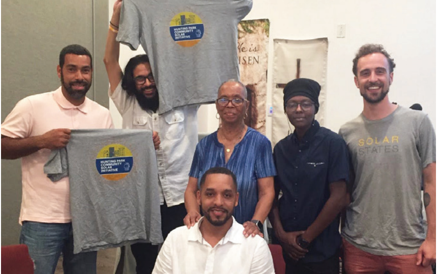
Graduating class from the Hunting Park Community Solar Initiative.