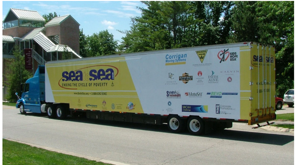
The 53-foot Sea to Sea gear trailer left Grand Rapids for the west coast on July 21 after being packed with supplies and some riders' bicycles.

thing left to do was start the journey (or start a new phase the ongoing journey).