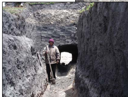
(left) The outlet tunnel. The pipes and valves have since been installed.