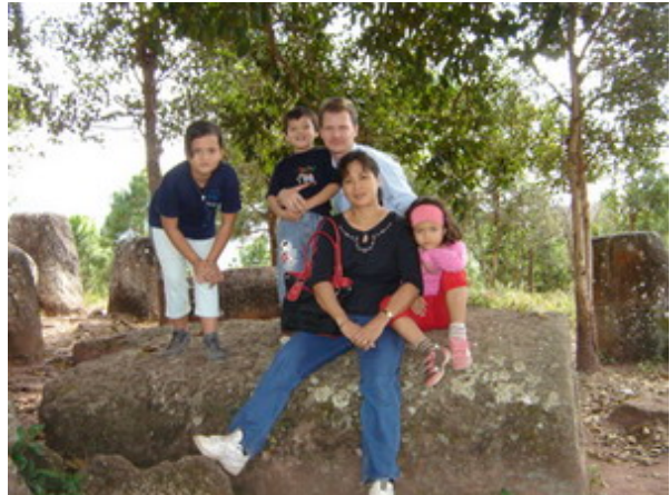
A quick visit to Plain of Jars Site 2

The following day we went as a family to visit a project village and see firsthand some of the activities going on there. And on the way back to the office, stopping in at the Plain of Jars.