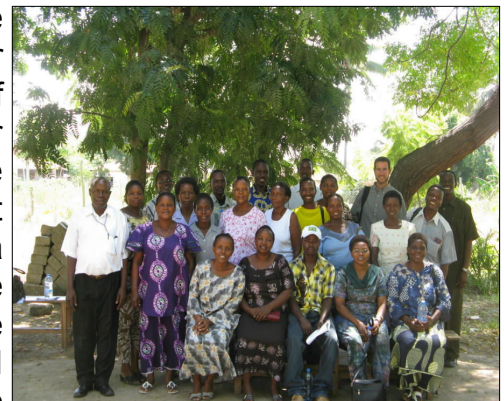
The group that came to the Kigamboni cluster introduction meeting.

Through the use of cluster groups, some of the younger groups have discovered that they can learn a lot from the older and more experienced groups. It is so exciting to see how animated