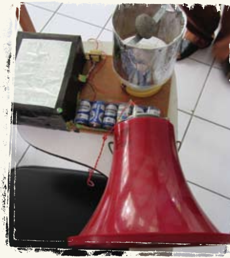
An emergency warning system developed by community members

"One day the head of my village asked me to join the training organized by CRWRC/GenAssist. At first, I didn't want to participate. I had friends who had attended similar trainings by other organizations in the past. As soon as