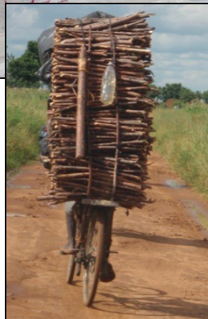
Pictured right: don't try this at home!