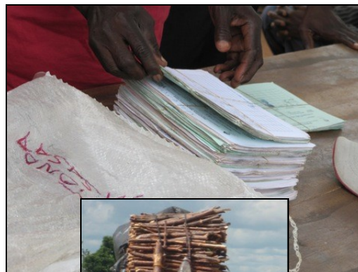
Pictured left: beneficiary cards at a distribution

Maize seed and fertilizer distributions have taken place for those involved in the Food for Work / Conservation Farming program, and vegetable garden seeds have been distributed to those who cannot do the work for various reasons.