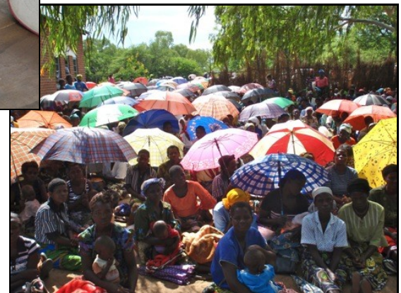
Pictured below: The sun is out and so are the umbrellas!