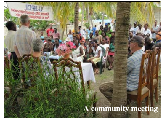
A community meeting