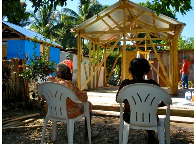
Transitional shelter being built, while people look on.