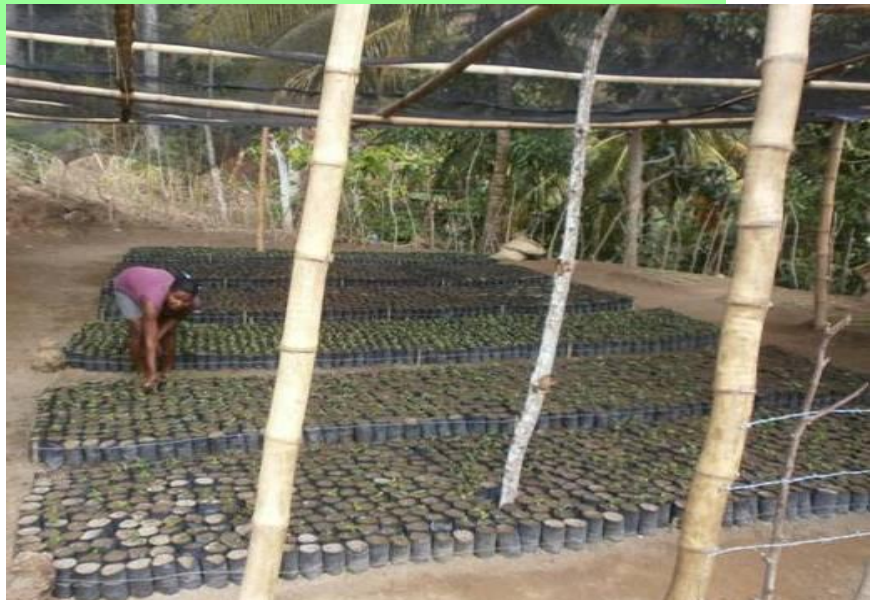
The nursery in Morin

There are already 13 communities who finished constructing their nurseries and almost all seeds started to germinate. CRWRC/ZOA provided the plastic bags, seeds and water containers for farmers to store water. The rest are Community counterparts.