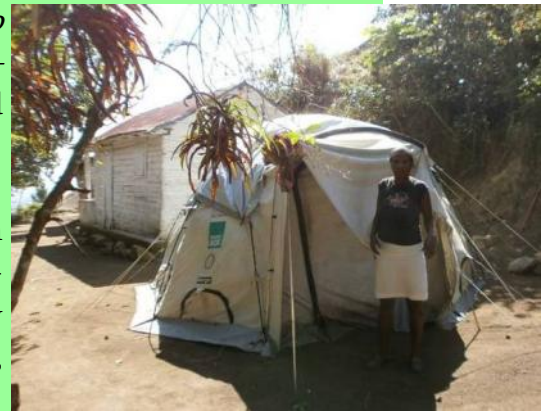
Blanchard in front of her tent house

She showed to us the nursery that the farmers constructed with newly germinated lemon, coffee and orange. They are all excited to plant these seedlings comes August . Also in the nursery are some vegetables seeds that also germinated i.e. cabbage, sweet pepper and carrots.