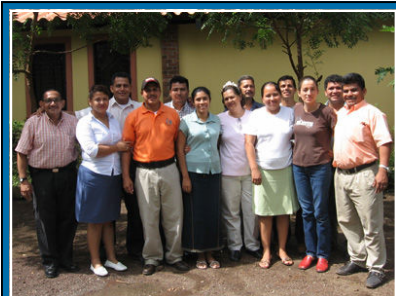
Staff at the Nehemiah Centre

Cruz began by studying many different approaches to