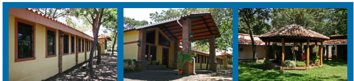
The Nehemiah Centre