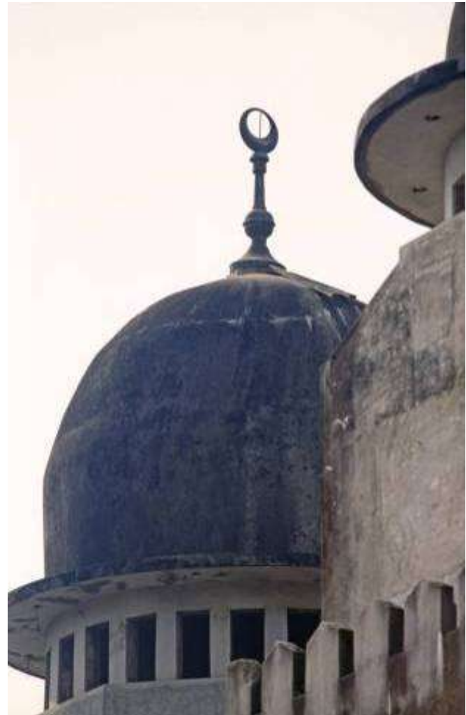
A mosque in Liberia