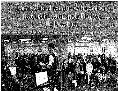
Local Churches are Witnessing to Muslims through Friday Fellowship

Several people sent me a Face Book tape on clashes between Christians and Muslims during the Arab American Festival in Dear-