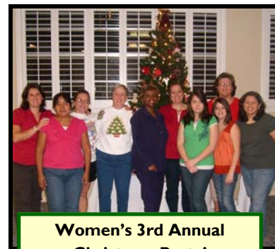
Women's 3rd Annual Christmas Party!