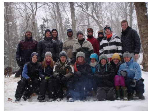
ANNUAL DOG-SLEDDING EXPEDITION

At McMaster & Mohawk this is a journey we undertake joyfully as a community of believers. Enjoying and exploring God's creation we welcome all who would join us in celebrating God's gift to us of higher education. •